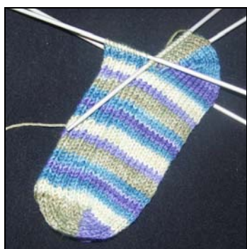
The heel is worked in the same manner as the toe.

*If you prefer to use 3 needles, or two circulars, then you can but if you are not familiar with sock knitting or my techniques, I recommend using the 4 DPs for your first pair.