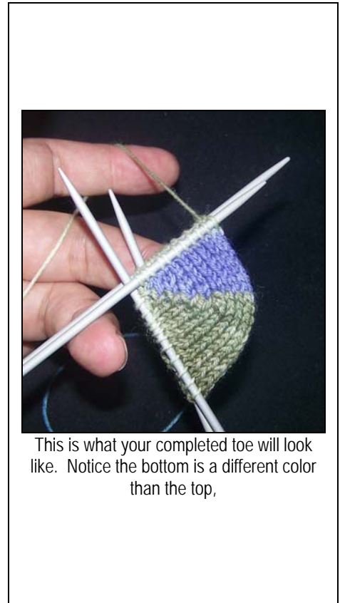
This is what your completed toe will look like. Notice the bottom is a different color than the top,

You should again have 22 sts on the DP needle and 22 still on the circular needle. Your completed toe will look like a neat little cup. Also this needle will be known as needle #1. Now you are ready to set up for the foot. (begin working in the round by picking up and working the stitches that are on the circular needle.)